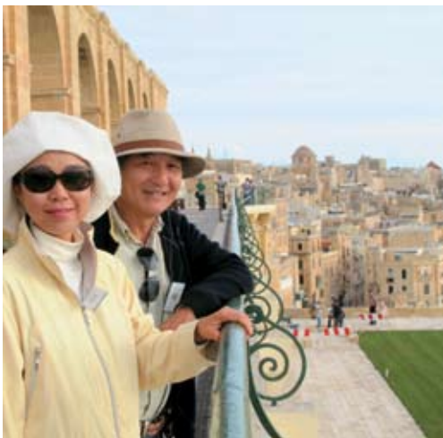
In the old town of Malta's Valletta

Saturday, August 18 ■ MONOPOLI and the TRULLI VILLAGES, Italy The fishing town of Monopoli is dominated by its 1552 castle. Explore the region's unique trulli villages, with their curious whitewashed conical dwellings built without mortar. Focus on two of the main villages, Alberobello, where trulli line the streets, and hilltop Ostuni, an ancient town enclosed within ramparts. (B, L, D)