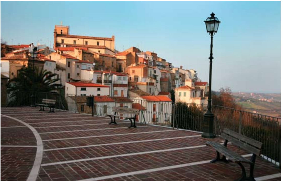
The quaint town of Chieti in Italy's Abruzzi region

RATES: Venice: $1,125 per person, double occupancy; $395 single supplement; Barcelona: $1,095 per person, double occupancy; $395 single supplement