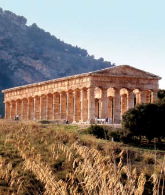
Segesta's superb 5 th -century B.C. temple