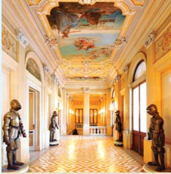
The Palazzo Parisio in Valletta, Malta, site of one of our private concerts