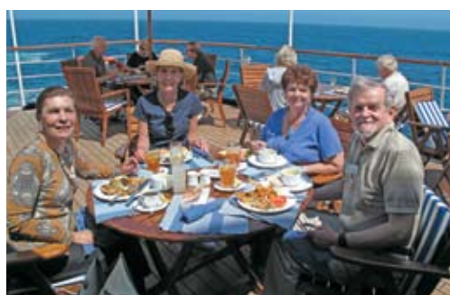
Dining alfresco aboard ship